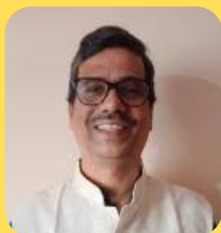
Dr. Madhukar Dalvi Nagindas Khandwala College, Mumbai.